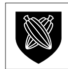
BELGIAN CHOCOLATE SCHOOL

SMALLANDLAAN 4 UNIT 2 • 2660 HOBOKEN, ANTWERPEN • BELGIUM